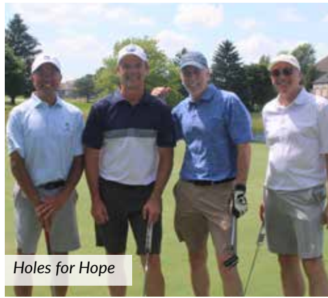
Holes for Hope

The Holes for Hope Golf Outing was back in full force this year with 109 golfers and 121 diners. Many others participated by sponsoring the event, soliciting and donating items for the silent and live auctions, donating to the Wall-of Wine and purchasing Wall of Wine raffle tickets, and providing a monetary donation. There were volunteers who gave generously of their time to staff a check-in table, sell raffle tickets, organize auction items or watch for a hole-in-one. There were raffle winners, contest winners and golf foursome prize winners. At the end of the day, St. Thomas Cares turned out to be the biggest winner because the Holes for Hope Golf Outing raised more than $32,000 to benefit the people helped by St. Thomas Cares.