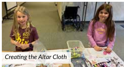
Creating the Altar Cloth