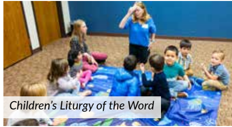
Children's Liturgy of the Word

Our Family Faith Activities were a lot of fun as well. We met after Mass for food, fellowship and a family activity during Advent, Lent, Summer Kick-off and Back to School. We plan to continue to grow these family faith activities with the goal to connect the families of St. Thomas and build community.