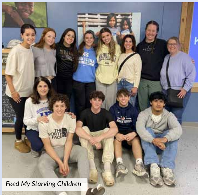
Feed My Starving Children