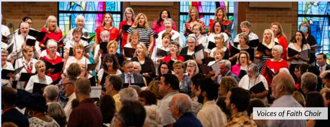
Voices of Faith Choir