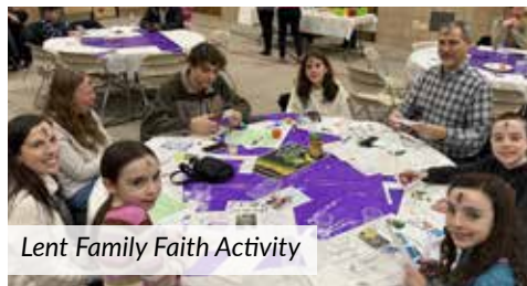
Lent Family Faith Activity