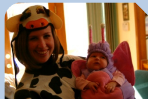
cow and butterfly