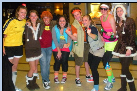
soccer player, eskimo #1, fire, water, heart, wind, aerobic instructor, eskimo #2