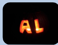
the official Authentic Life jack-o-lantern