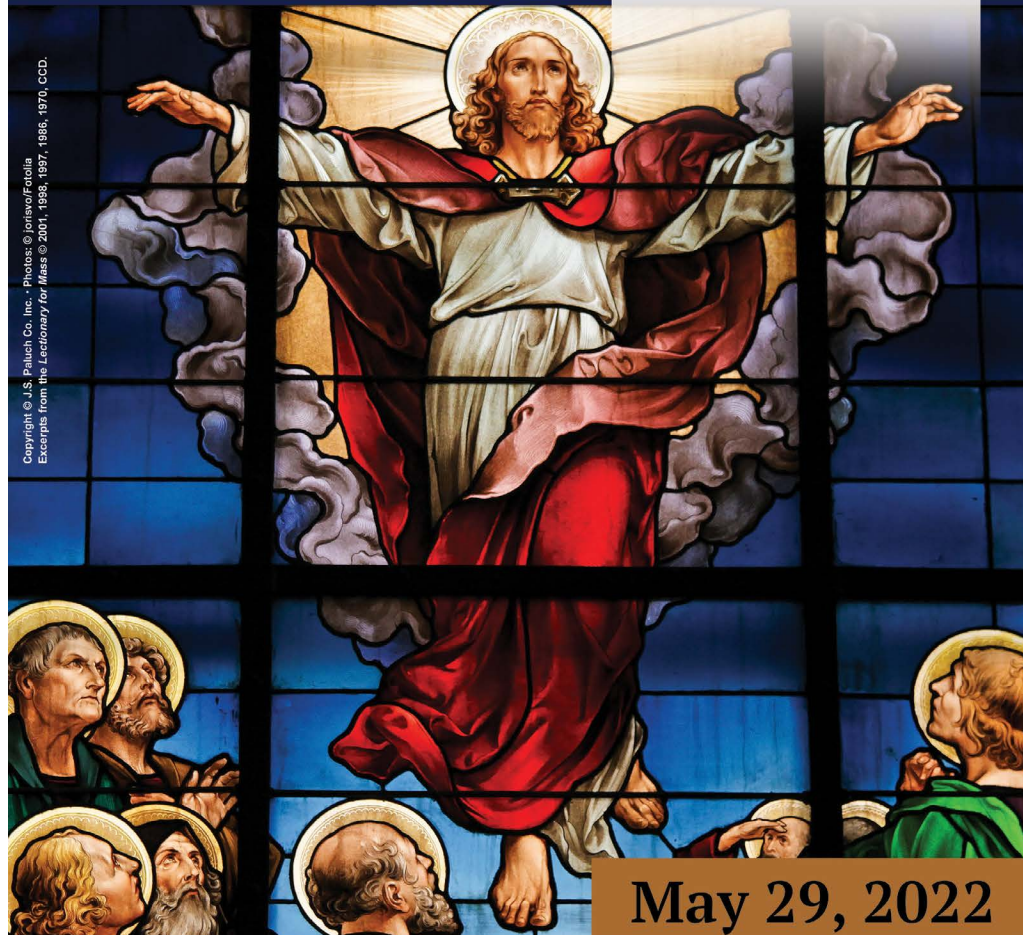
Copyright © J.S. Paluch Co., Inc. - Photos: © Jorjawa/Fotolia Excerpts from the Lectionary for Mass © 2001, 1998, 1997, 1988, 1970, CCD.