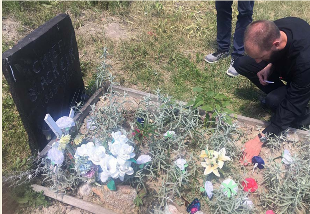
Grave of Nicholas Black Elk

Nicholas Black Elk was a Lakota Holy Man and a Catholic catechist. His grave is located in the cemetery at St. Agnes, St. Thomas' Twinning Parish on the Pine Ridge Indian Reservation in South Dakota. His cause for canonization is currently under review at the Vatican.