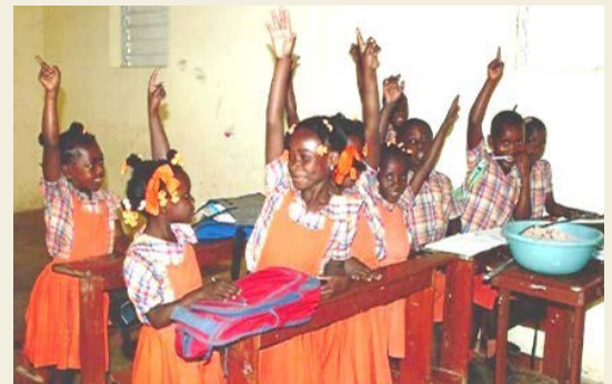
Elementary school students

Whether you are able to donate or not, please take home a picture of a Duchity student and pray for that child.