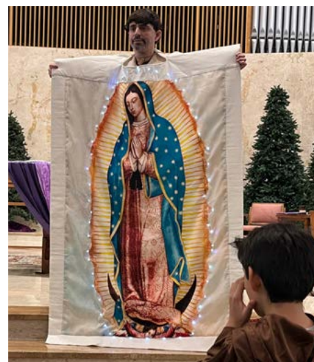
Juan Diego and the Miracle Tilma