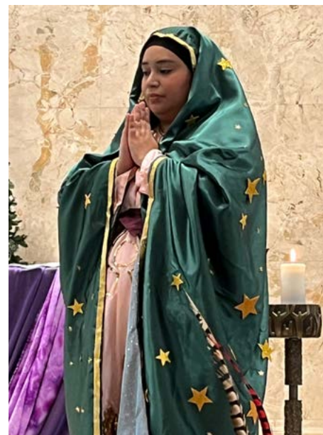
Our Lady of Guadalupe