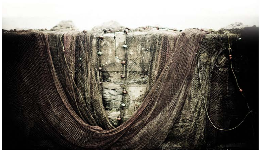
Copyright © J. S. Paluch Co., Inc. Excerpts from the Lectionary for Mass © 2001, 1998, 1997, 1986, 1970, CCD.