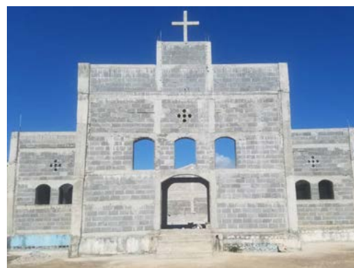
Ste. Marie-Madeleine Church under construction.

The goal for the Lenten project is $12,000. There will be more detailed information in the bulletin next weekend. In the meantime, please pick up a little brown box at the church exits and save your change during Lent to be returned by Easter Sunday.