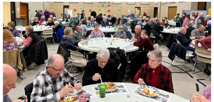
Around 300 people enjoyed the Knights of Columbus fish fry Friday, March 24. Thanks to all who joined us!

Happy Easter! 7:00 am Mass, Church 8:45 am Mass, Church (livestreamed) 10:30 am Mass, Church 12:15 pm Mass, Church