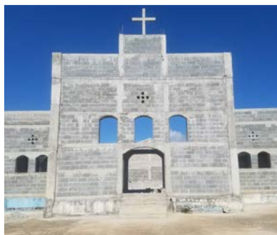
Ste. Marie-Madeleine church under construction.