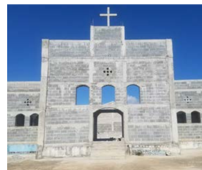
Ste. Marie-Madeleine church under construction.

Funds collected above the goal will help with additional construction needed to finish the church.