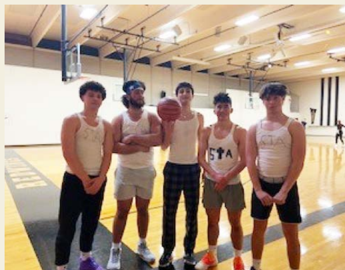
Youth Ministry Deanery Basketball Tournament Winners! Congrats to our St. Thomas the Apostle guys for winning our March Madness Tournament!