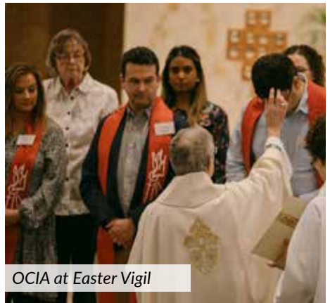
OCIA at Easter Vigil