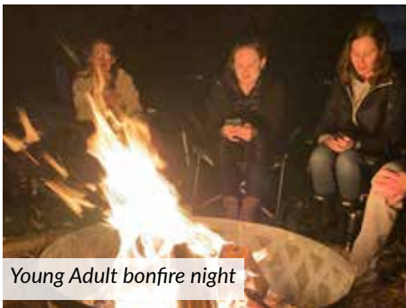
Young Adult bonfire night