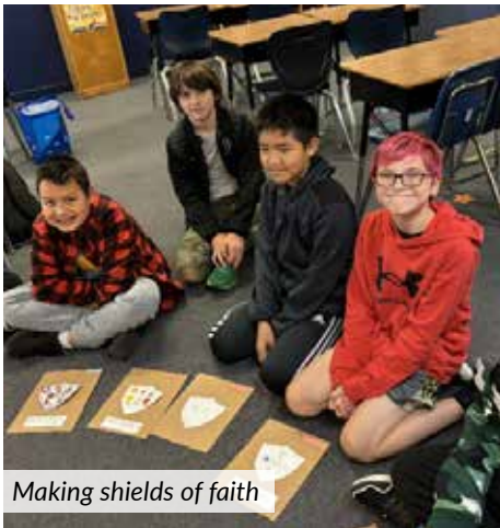
Making shields of faith