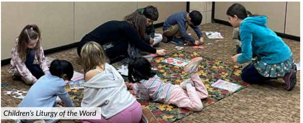
Children's Liturgy of the Word