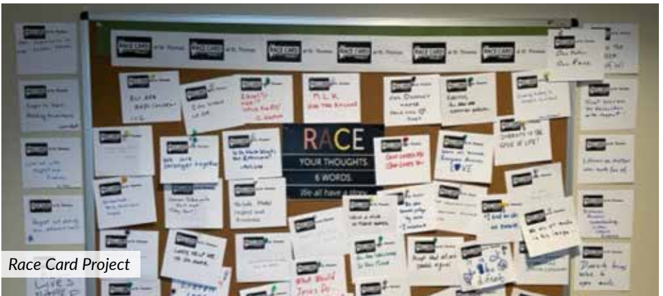
Race Card Project