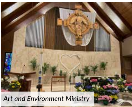
Art and Environment Ministry