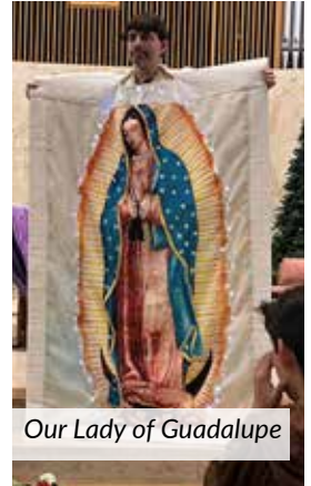
Our Lady of Guadalupe