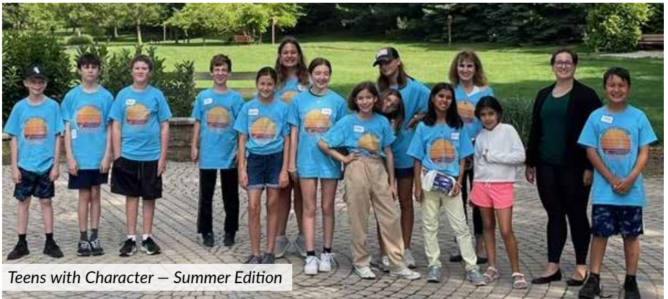
Teens with Character – Summer Edition