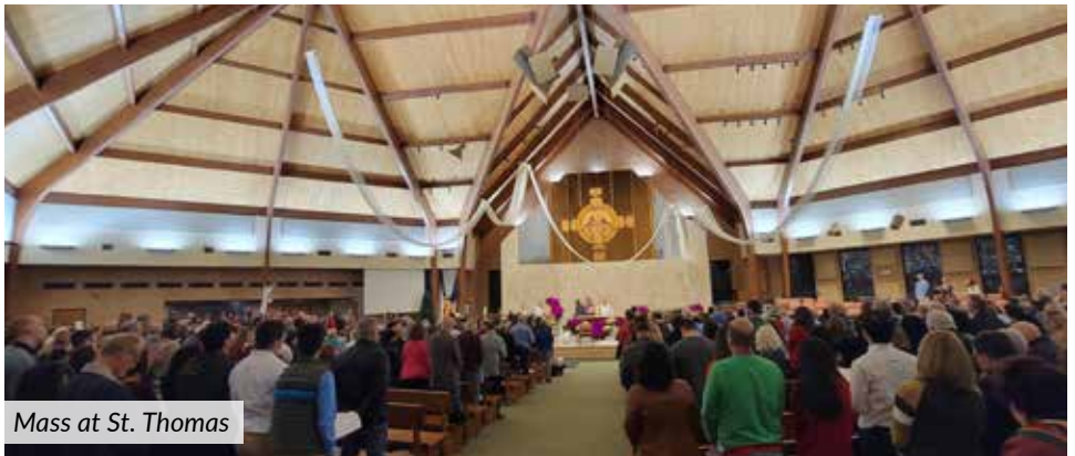
Mass at St. Thomas