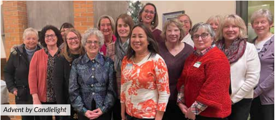
Advent by Candlelight