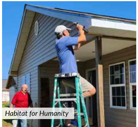
Habitat for Humanity